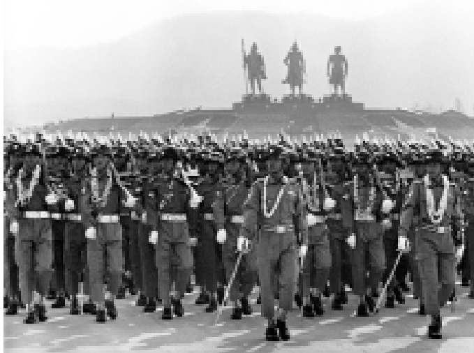
Military parade in the new capital which cost over US$200 million to build

As oil and gas revenues are the single largest income source for the regime, it is widely believed that UMEHL has access to these revenues for the purchase of weapons.