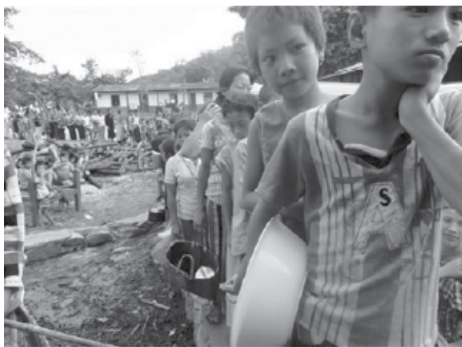
In June 2011 a 17-year old ceasefire was broken in Kachin State; the fighting has displaced an estimated 60,000 people. Control of the state's natural resources is at the heart of the conflict.