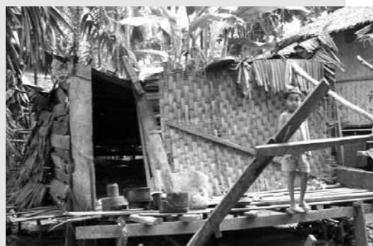
Poverty rates are high in Arakan State

The upcoming Shwe gas project in the state is expected to produce 500 million cubic feet of natural gas per day for 30 years. Although Burma suffers from chronic energy shortages, the vast majority of the gas will be exported to China.