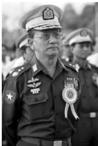
General Thein Sein now president