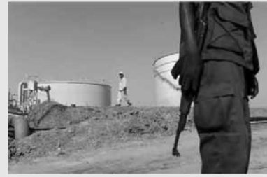
Sudan ended decades of civil war with an agreement to share oil revenues equitably

One thing is sure: systems for public disclosure of money flows, independent revenue management and auditing, civil society input, and equal benefit sharing are necessary for avoiding the curse of natural resources and the revenues they generate.